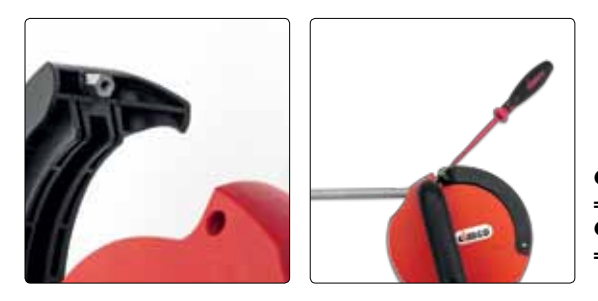
Counter-clockwise rotation = reduce pressure Clockwise rotation = increase pressure

If it is not possible to transport the fibre glass rod correctly, the distance between the driver and the transport disc can be increased or reduced with the aid of a slot-head screwdriver (2.5 mm x 0.4 mm) and by turning the adjusting screw and thus increasing or reducing the pressure.