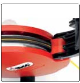
Carefully work with compressed air between the drive disk and the housing half to reinforce the cleaning process.