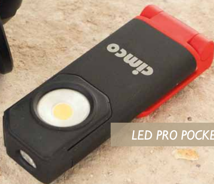
LED PRO POCKET