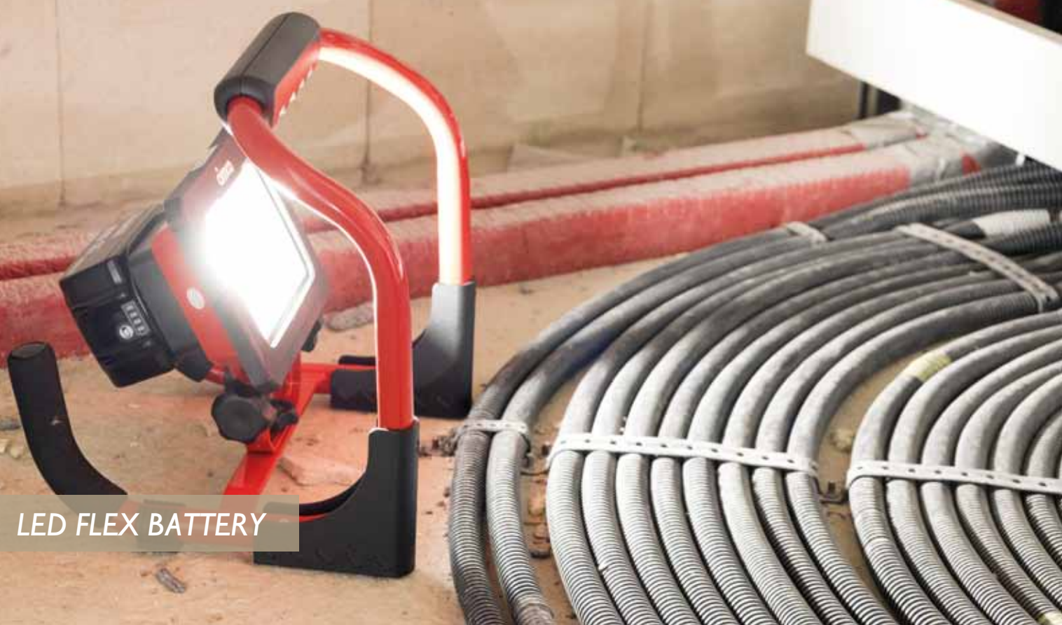
LED FLEX BATTERY