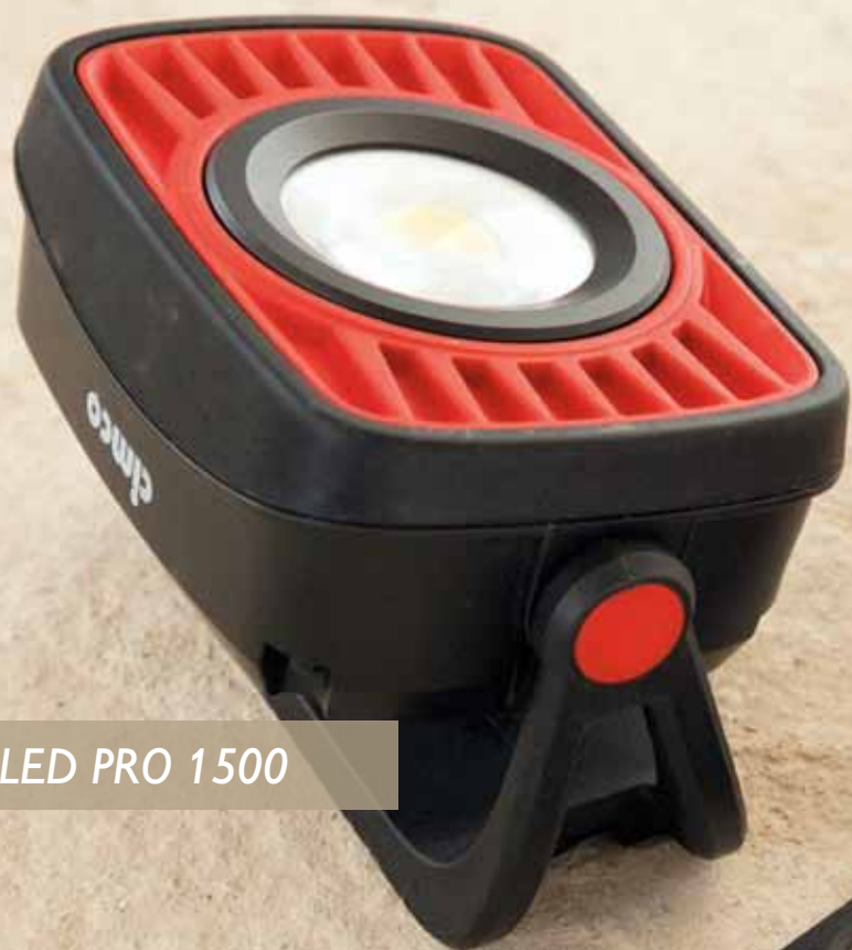
LED PRO 1500