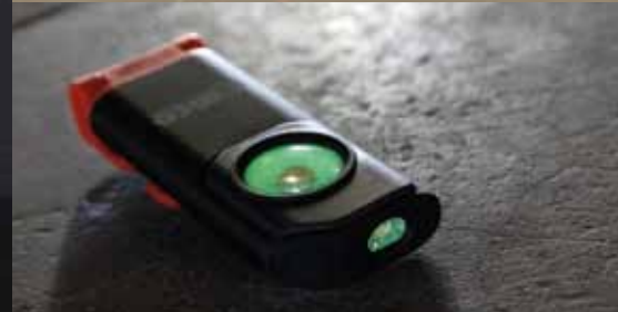
Find your light